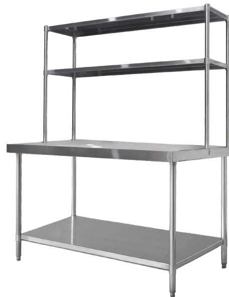
Double Overshelf (MROS-4RE, MROS-5RE, MROS-6RE)